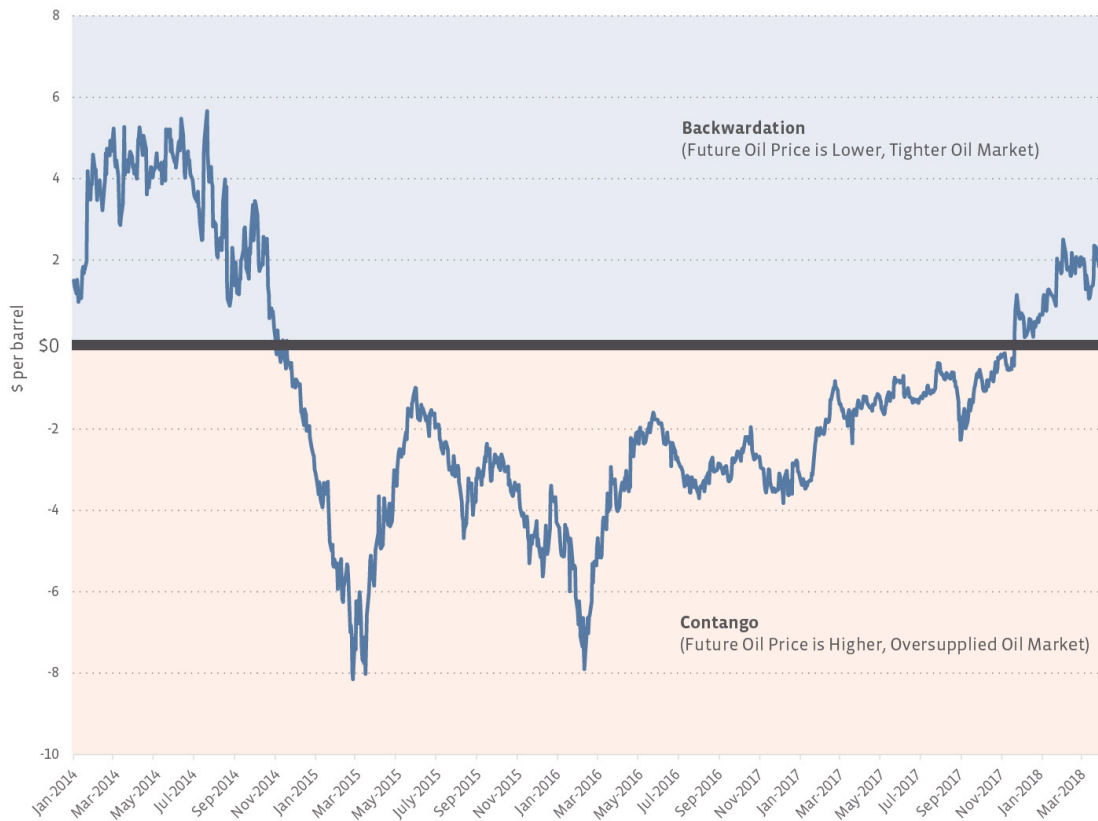
The WTI Crude Curve Shifted into Backwardation in Late 2017 After Three Years in Contango

Note: Spread is represented by the difference between the generic 1st month contract and generic 6th month contract.